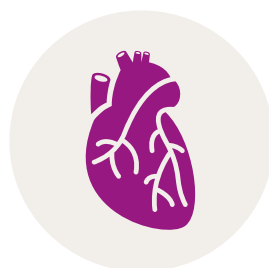
Heart muscle after ischemic injury