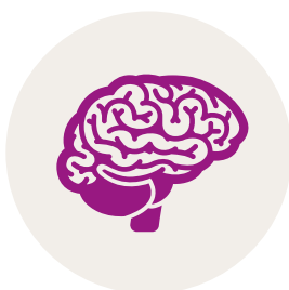
Neurons from oxidative damage