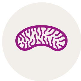
Mitochondria within human cells

Many international studies suggest that PQQ has a protective effect on different health areas: